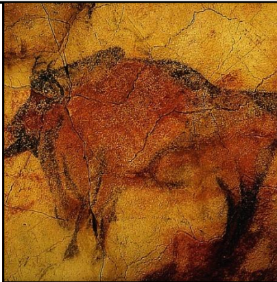
Connect with the intelligence of your ancestors as you admire their attention to detail and grasp of perspective

Our small group (8 or less) itineraries are entirely customizable, personal and unique, and capture the essence of Northern Spain.