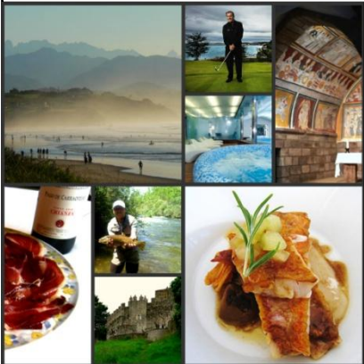
Enjoy Northern Spain's wonderful food/wine, nature, culture & history

We provide transportation, make the best recommendations for accommodation based on your preferences, and carefully consider all of your interests to plan an unforgettable stay.