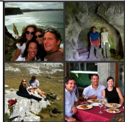
Enjoy special places with a local who also speaks perfect English